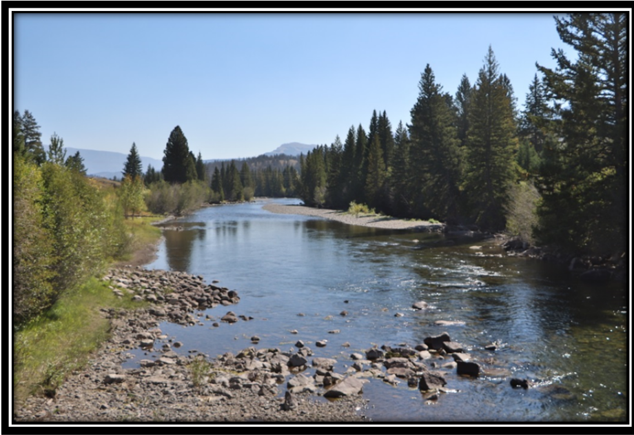
Clarks Fork River