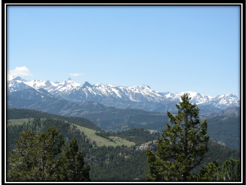
Absaroka Mountain Range